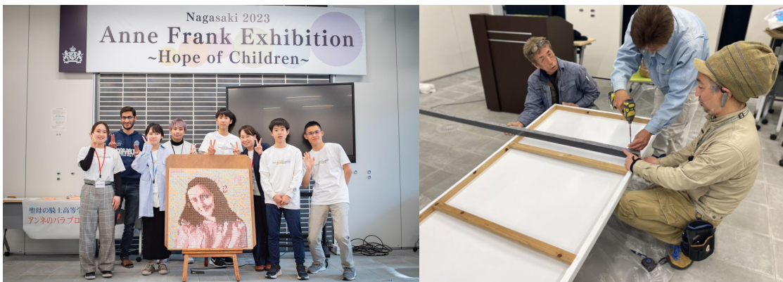
Tile art of Anne Frank and the attachment of the horizontal banner

Thankfully many companies have supported us. For example, the horizontal banner and tile art of Anne Frank are the gift from the company in Nagasaki. Because of the help from many people and companies, we were able to make a wonderful event.