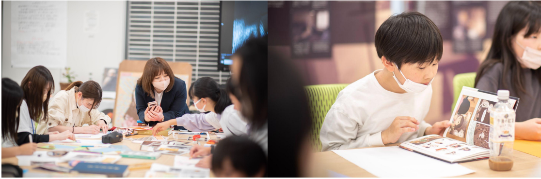
Children making the materials

Anne Frank exhibition has become an opportunity to think about the past, present and the future. We adults didn't involve so much with the event to cherish the curiosity and proactivity of the children. Now we are living in a hard era in which many things occur such as the prevalence of the Covid 19 and Ukrainian invasion. We think that we had able to send a message of peace to the world from the atomic-bomb land Nagasaki.